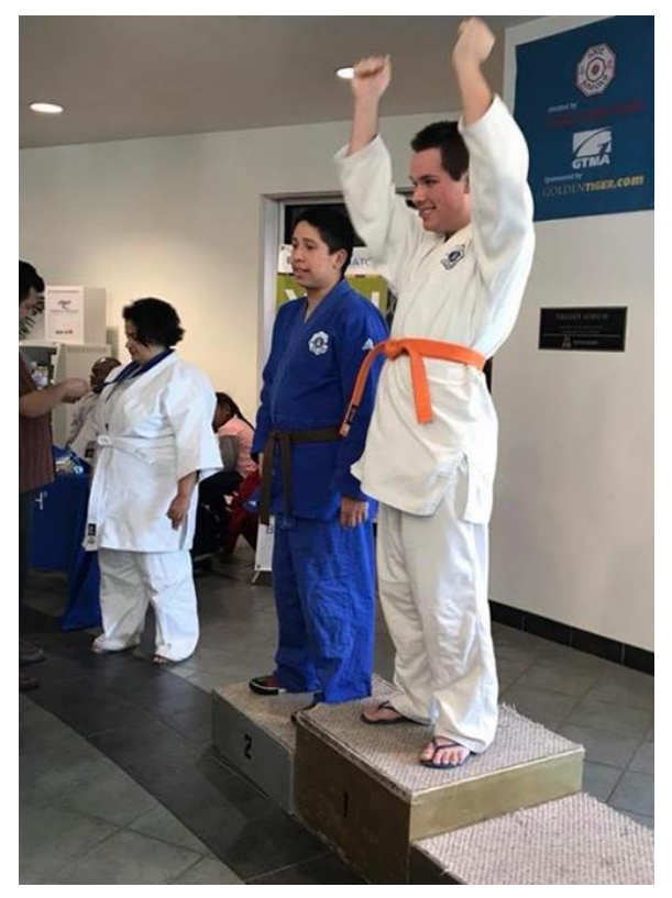
Special Needs Division