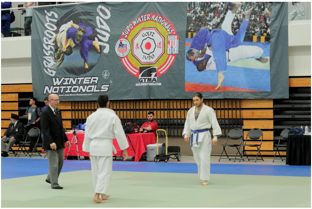
See you next year!